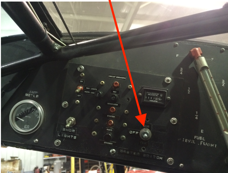
Top Upper Right of Cockpit